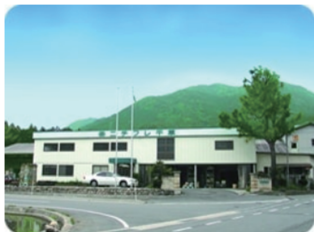
• Nichifule Chigusa Corporation