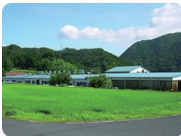
• Nichifule Shimane Corporation