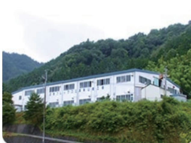
• Yamasaki Factory