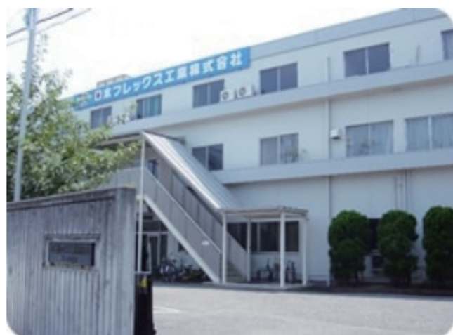
• Head office and Itami Factory